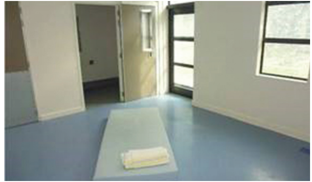
Caption: Another example of a seclusion room in a mental health facility. The door directly in front of the mattress leads to an ensuite bathroom.

procedures, given they would not be able to hear alarms. 135 This indicates that reasonable accommodation is not always being proactively considered. However, the Chief Ombudsman did observe an example of good practice of reasonable accommodation at the Auckland South Corrections Facility which has installed in-cell telephones and user interfaces. This is a positive initiative that ensures disabled prisoners can effectively communicate. 136