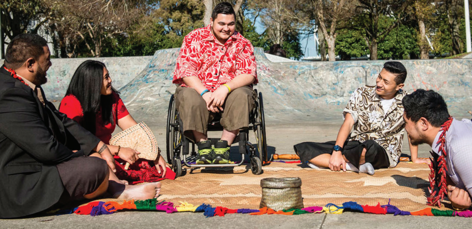
Caption: “Fofola e fala kae talanoa e kāinga” The fala (mat) is a common space for talanoa (dialogue) with family and friends. A group of five friends sit on a mat chatting. Le Va has produced organisational guidelines for disability support services to enable culturally intelligent care for Pasifika families.