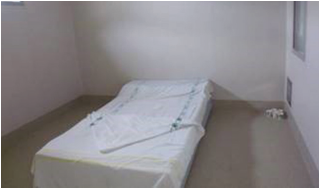
Caption: A seclusion room in a mental health facility without ensuite facilities. A mattress lies on the ground in the middle of the room.