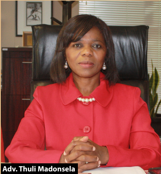
Adv. Thuli Madonsela

WELCOME TO THIS the fifth edition of the African Ombudsman Today, and the first publication for 2013. We hope you have had a chance to enjoy a restful and enjoyable end-of-year break. In this issue we reflect on the outcomes of some important events, such as the AORC Board meetings, the publication of the AOMA History Book and training initiatives.