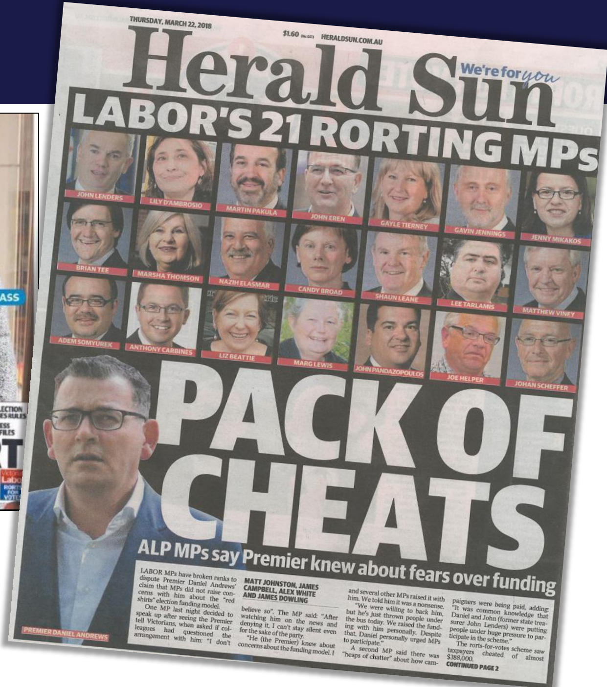
PREMIER DANIEL ANDREWS