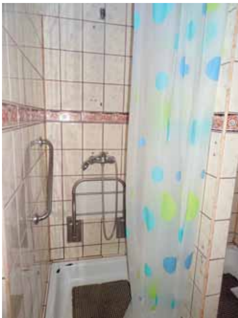
Interior of one of the shower cabins for convicts (Pr in Lubliniec)