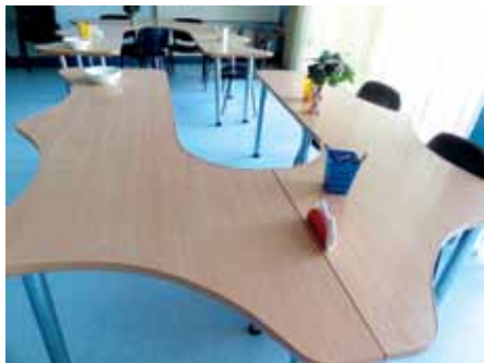
Table in the dining room adjusted to the needs of persons in wheelchairs (SCC in Częstochowa)