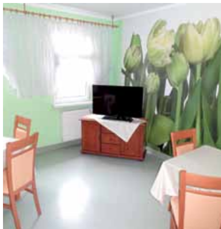
Dining room (SCC in Poznań)