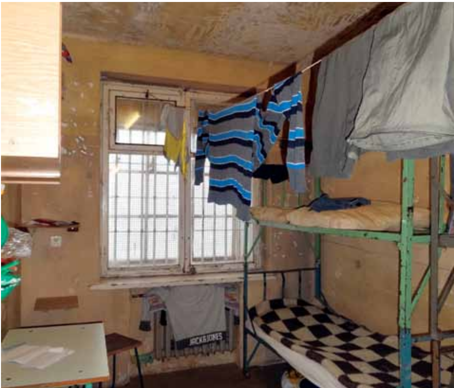
One of the residential cells (PTDC in Łódź)