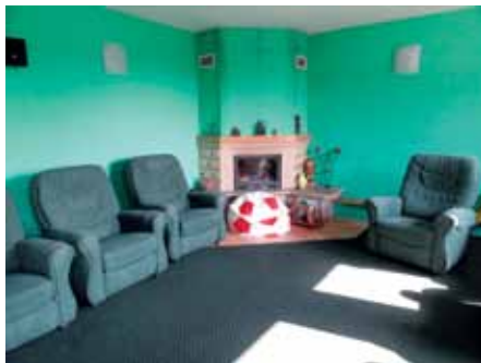
Day room (SCC in Częstochowa)