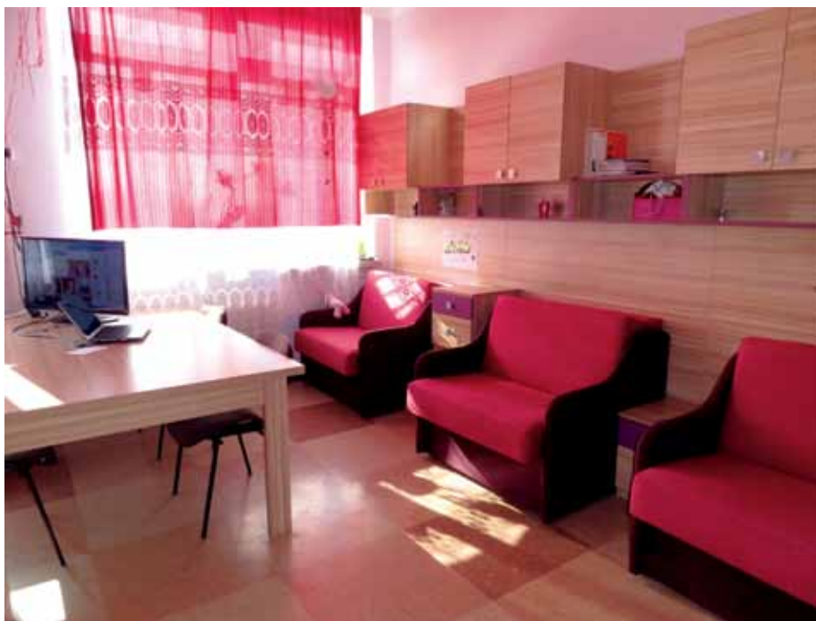
One of the charges' bedrooms (YCC in Węgrzynów)