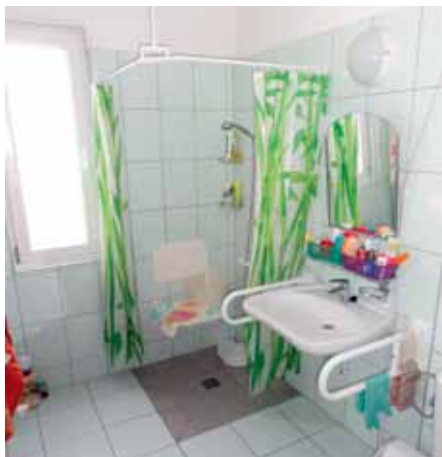
Bathroom (SCC in Poznań)