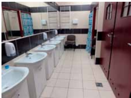
Charges' bathroom (YCC in Węgrzynów)