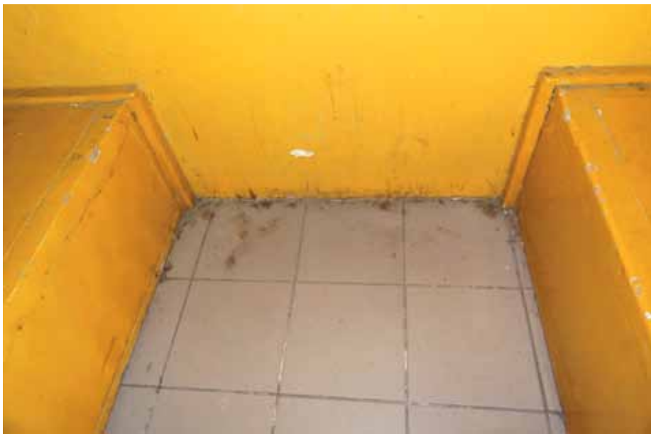
Level of cleanliness in one of the rooms for detainees (PDR in Myszków)