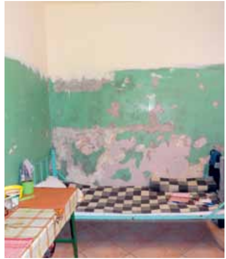
Residential cell (PTDC in Warsaw-Białołęka)