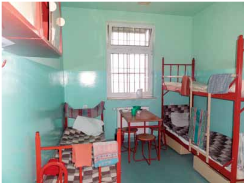
Residential cell (Pr in Opole Lubelskie)