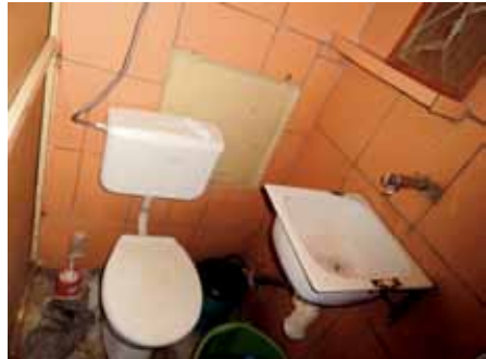
Sanitary facilities in one of the cells (PTDR in Łódź)