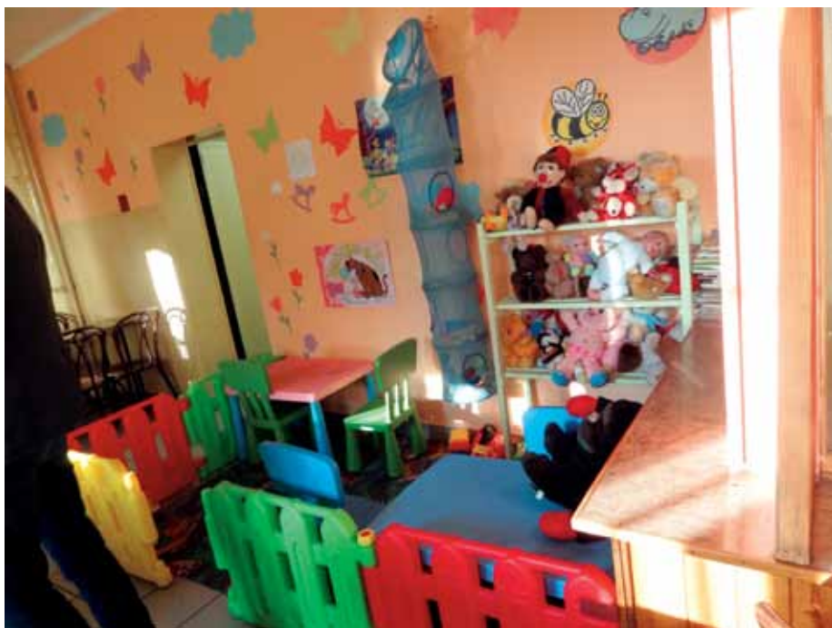
Children's corner in the visiting room (PTDC in Tarnowskie Góry)