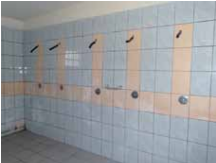
No partitions between the showers (EW in Buniewice)