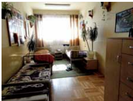
One of the charges' bedrooms (JDC in Tarnów)