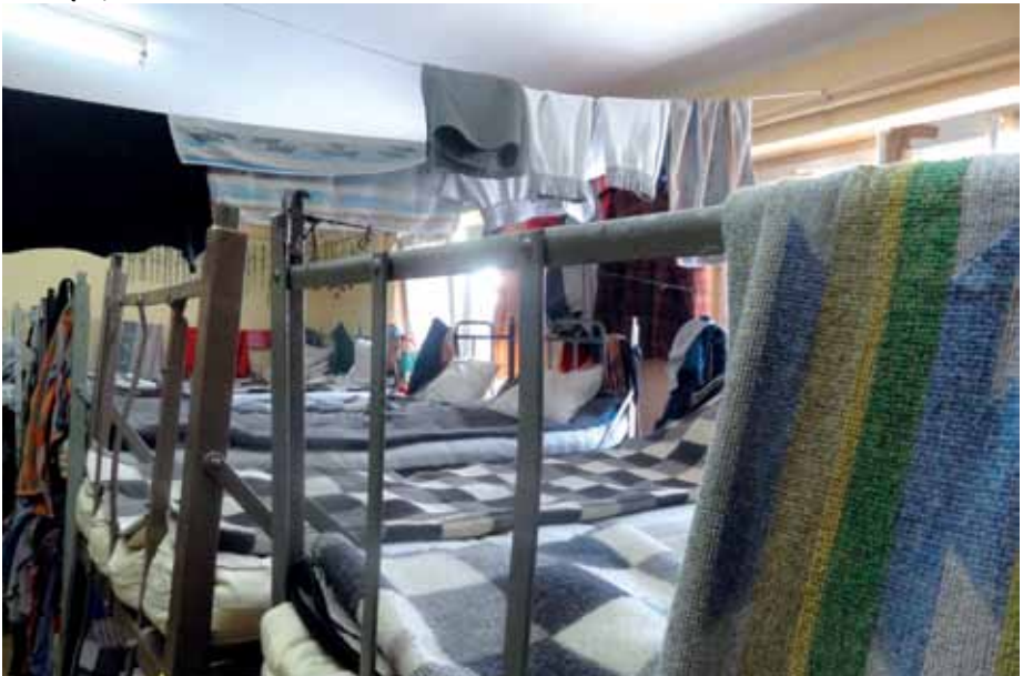
One of the multi-occupational residential cells (Pr in Łowicz)