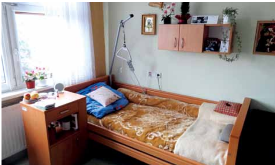
One of the residents' rooms (SCC in Poznań)