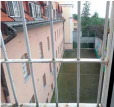
Window bars (YCC in Łańcut)