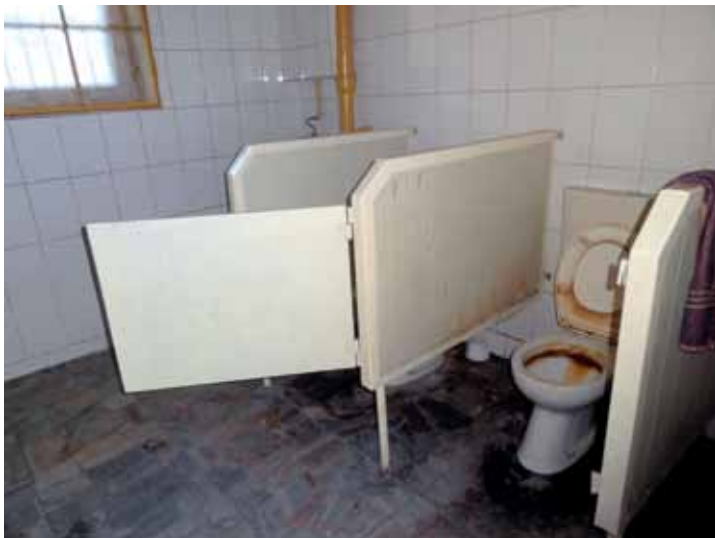
Toilet for detainees (PDR in Myszków)