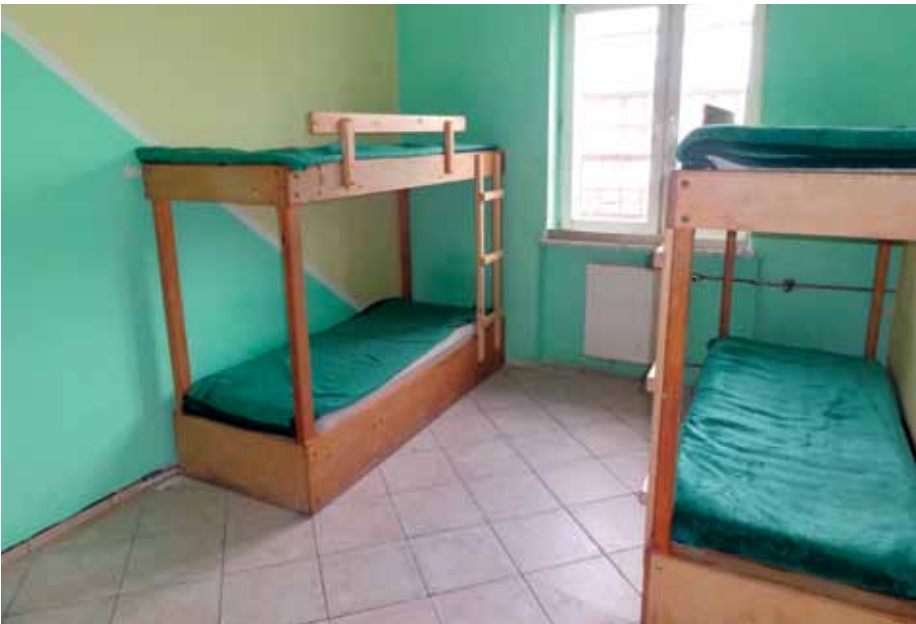
One of the charges' bedrooms (JS in Szczecin)