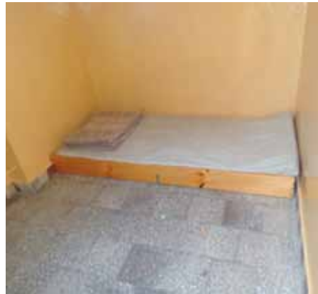
Transition room (YCC in Łańcut)