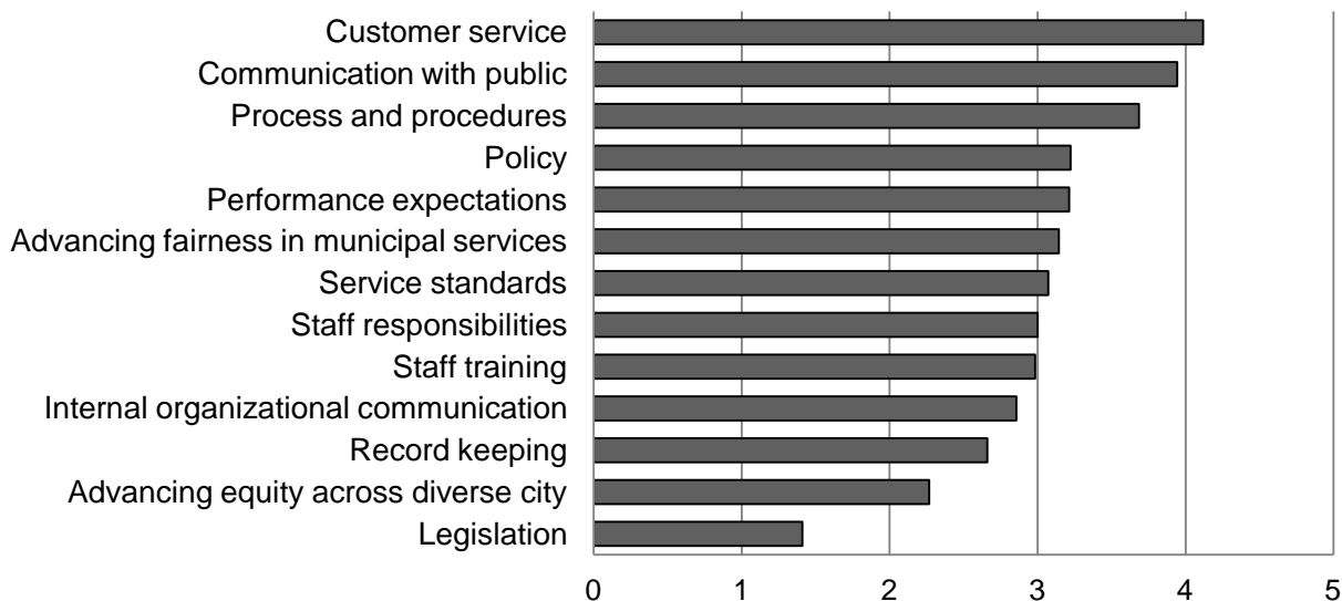
Graph 1: Perceived Level of Ombudsman Impact

(This impact assessment grid was administered to 28 people)