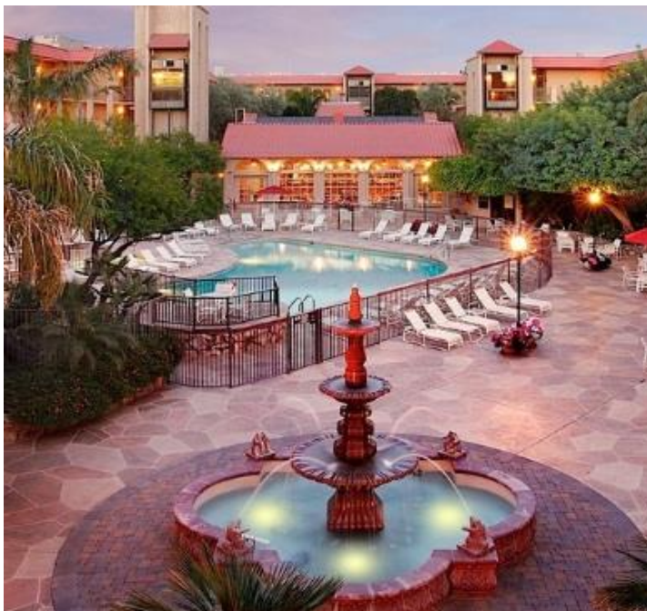
Chaparral Suites – Conference Venue

United States Ombudsman Association Business Office 200 W. 2nd Avenue Indianola, IA 50125 usoa@assocserv.com