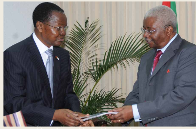
AOMA President shares with President Guebouza a copy of AOMA

It was in March 2012 that finally a delegation led by the President of AOMA undertook the trip to Mozambique where they met with all the political parties represented at Parliament, in addition to several other political authorities of the country such as the President of the Republic,