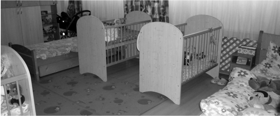
Reménysugár Children's Home

difficult by either serious disability or the need of the joint placement of siblings. The ten staff members of the children's home take care of the children under three in turns, which makes the formation of personal attachment impossible. The majority of children attended kindergarten or school outside the institution; their systematic development and engagement were ensured in the children's home as well.