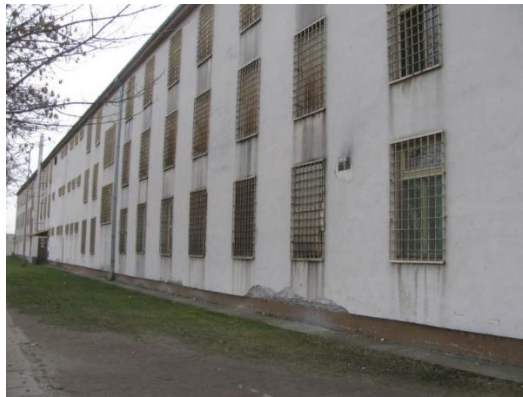
Juvenile Penitentiary Institution (Tököl)

The OPCAT is open to accession by any State that has ratified or acceded to the UN Convention against Torture and other Cruel, Inhuman or Degrading Treatment or Punishment. 2 Hungary acceded to the Protocol on January 12, 2012, more than two decades after ratifying the UN Convention. The Parliament designated the Commissioner for Fundamental Rights 3 as the national institution conducting regular, unannounced visits to places of detention (hereinafter the “National Preventive Mechanism, NPM” 4 ). I have to carry out this task as of January 1, 2015. 5