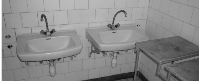
Lavatory in the Therapeutic House

In the Platán Residential Home, disabled persons deprived of their liberty had no access to intimacy room, and in the Therapeutic House there were cases when residents wanting to use the intimacy room had to stand in a queue. They had to ask for the key from a member of the staff, and they could use the intimacy room only after a certain, predetermined period of waiting, with the approval of the staff.