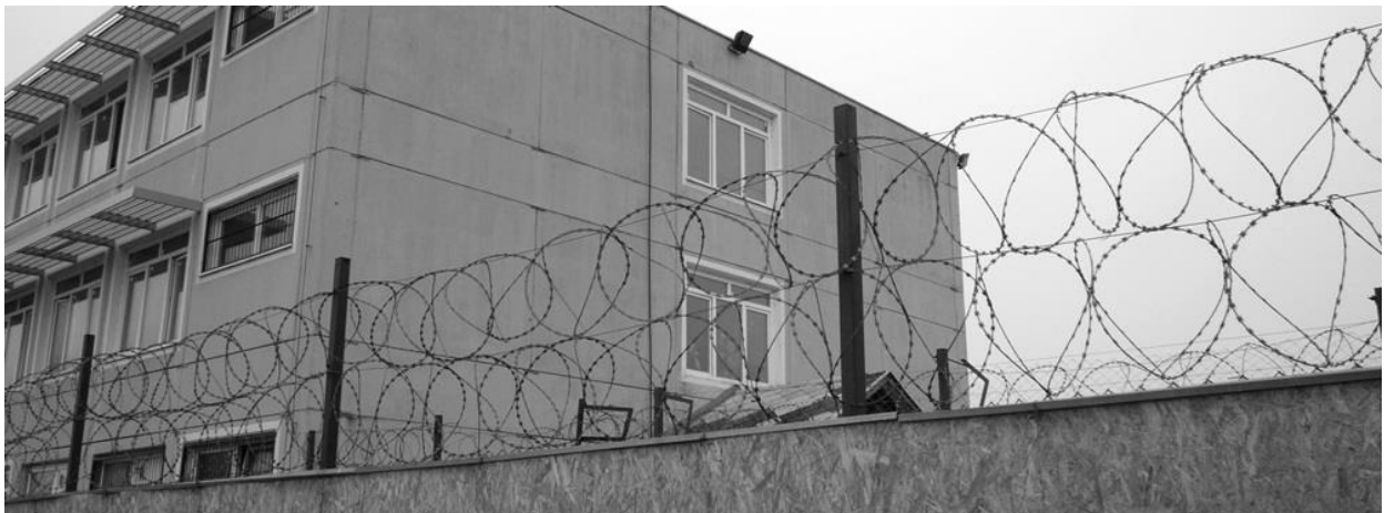
At the time of the visit, there were some children detained in the GRRC.

Despite the fact that even the longest period spent in the GRRC by one of its current residents was less than two weeks, this period had also left some psychological marks. Many of the detainees complained that, in the absence of organized programs, as a result of day-long inactivity, detention was rather wearing not only physically, but also mentally.