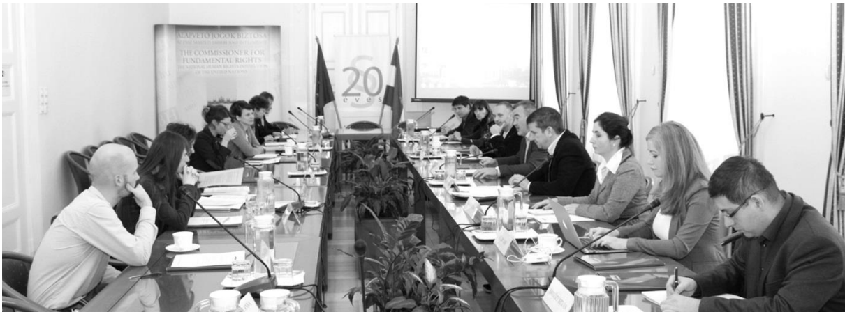
The November 24, 2015, meeting of the CCB

During the meeting I handed over a copy of the letter of Malcolm Evans, dated on October 27, 2015, to the members of the CCB.