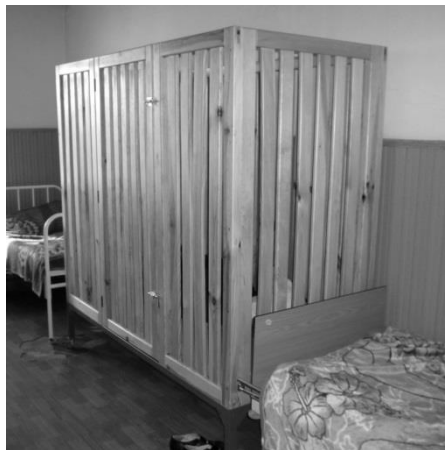
Adult cage bed

I also drew attention to the shortcomings of the protocol on restrictive measures vis-à-vis disabled persons living with disabilities in my reports on both the Therapeutic House and the Platán Residential Home. In the case of the Therapeutic House, I also suggested the termination of the use of cage beds for adults. In connection with the Platán Residential Home, I pointed out that organizing various leisure and community activities for disabled persons deprived of their liberty could render unnecessary or, at least, significantly reduce the use of tranquilizing shots.