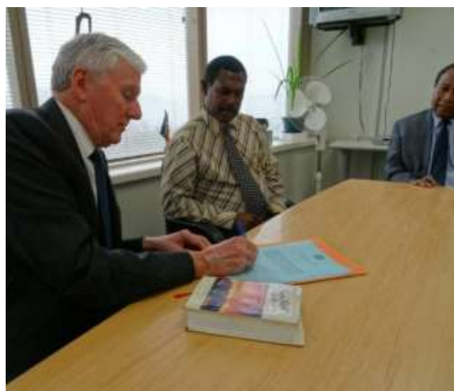
Ombudsman Neave with Dickson Morehari and Chief Ombudsman Lua

The Commonwealth Ombudsman, Colin Neave, was hosted on a visit to the Ombudsman Commission of Papua New Guinea on 9 September. Chief Ombudsman Rigo Lua OBE described his strategic vision to strengthen the position of the Ombudsman Commission to address maladministration and corruption and improve the lives of the people of PNG.